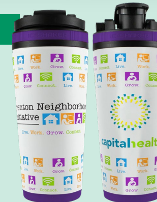
23004 Ice Shaker Original 4D Decoration 26 oz.