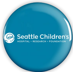
00113 Round Button-3"