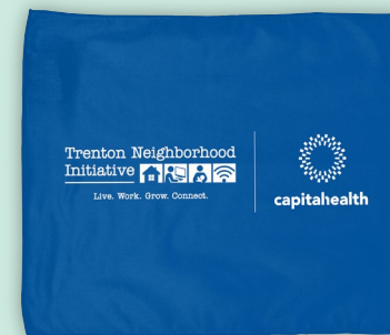
22591 Colored Rally Towel 15" x 18"