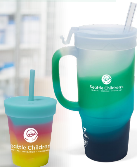
81316 Silipint Straw & Tumbler-8 oz.