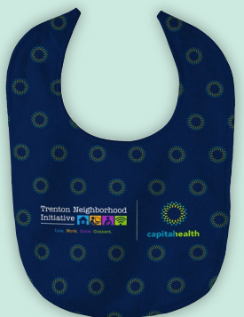
13776 Premium Poly Cotton Bib 10" x 13"