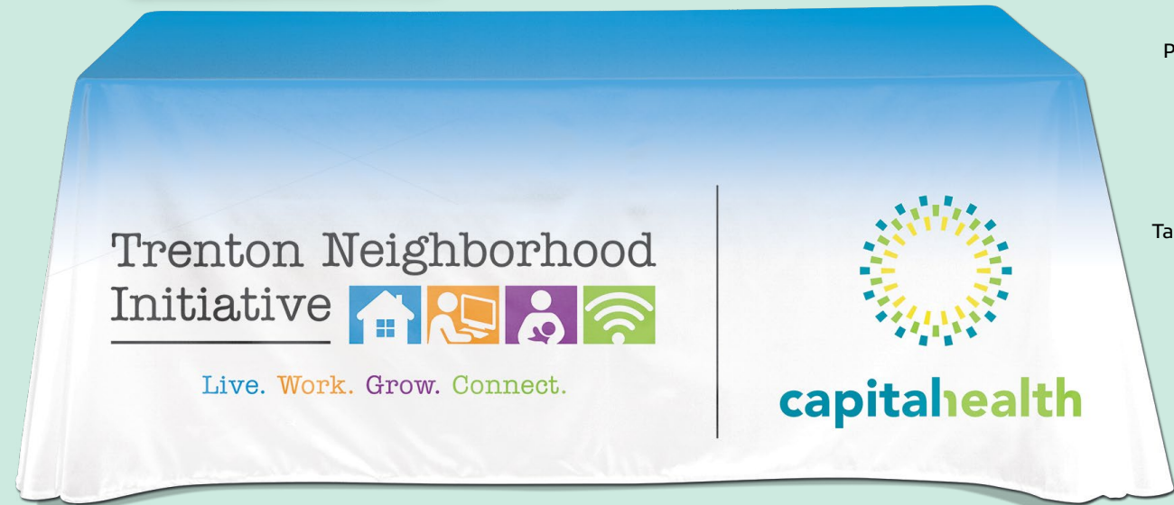
37134 Table Throw 2' x 6'