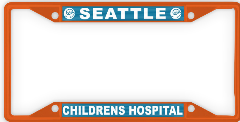
48900-CSS Colored Metal License Plate Frame