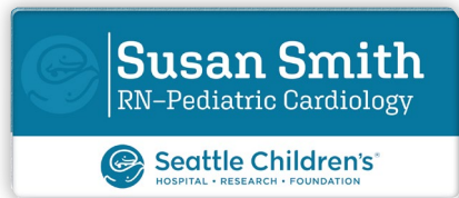
39505 Acrylic Name Badge-1¼" x 3"